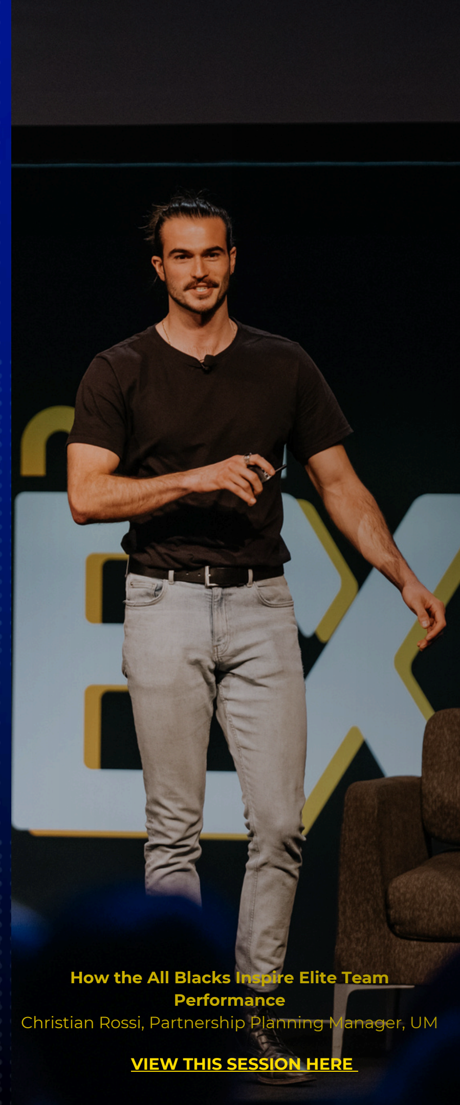
How the All Blacks Inspire Elite Team Performance

Please take a note of the dates above. If your content is selected for stage you will be required to participate in the MFA EX content rehearsals.